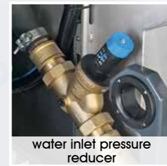
water inlet pressure reducer