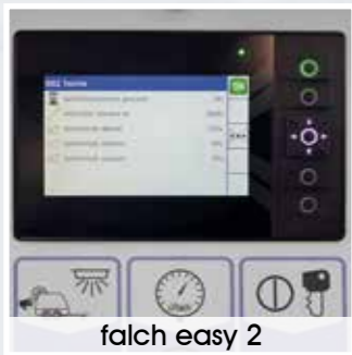
falch easy 2