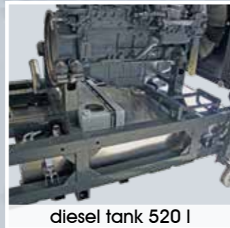
diesel tank 520 l