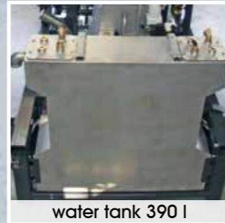
water tank 390 l