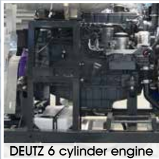
DEUTZ 6 cylinder engine