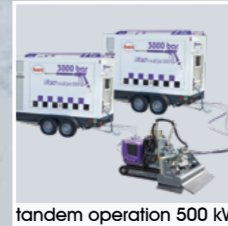
tandem operation 500 kW